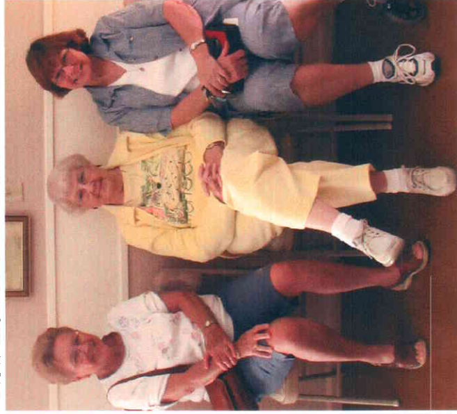
Special visitors at the Road Show